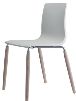
2823 HS 11

Scocca in tecnopolimero riciclabile. Gambe in legno massello. Per uso interno.