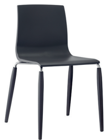
2823 FW 81